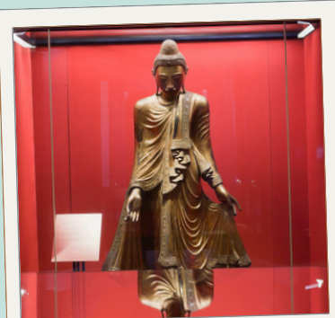
CHESTER BEATTY LIBRARY

Discover a stunning collection of rare books, manuscripts, and art from across the world: a unique glimpse into history and culture.