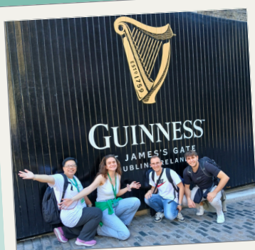
THE GUINNESS STOREHOUSE