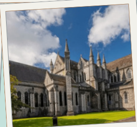
ST PATRICK CATHEDRAL