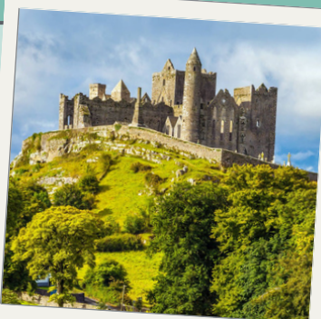
ROCK OF CASHEL