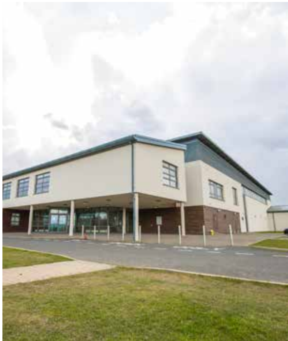
Ballinteer Community School Dublin, Ireland