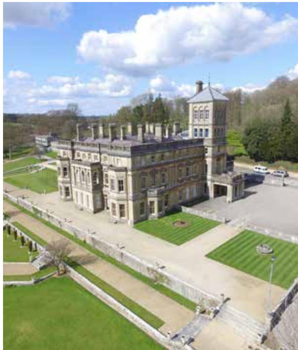
Rendcomb College The Cotswolds, UK